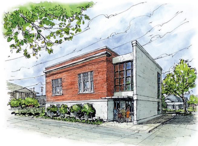
Elevator/Entrance Lobby Addition (2004 Scheme)