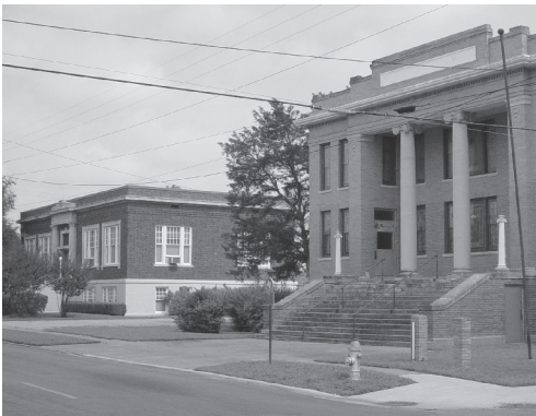
Red River Historical Museum beyond, former Walnut Street Church of Christ in foreground