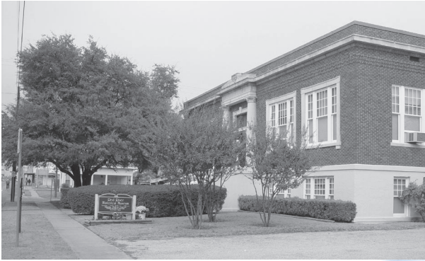
Red River Historical Museum