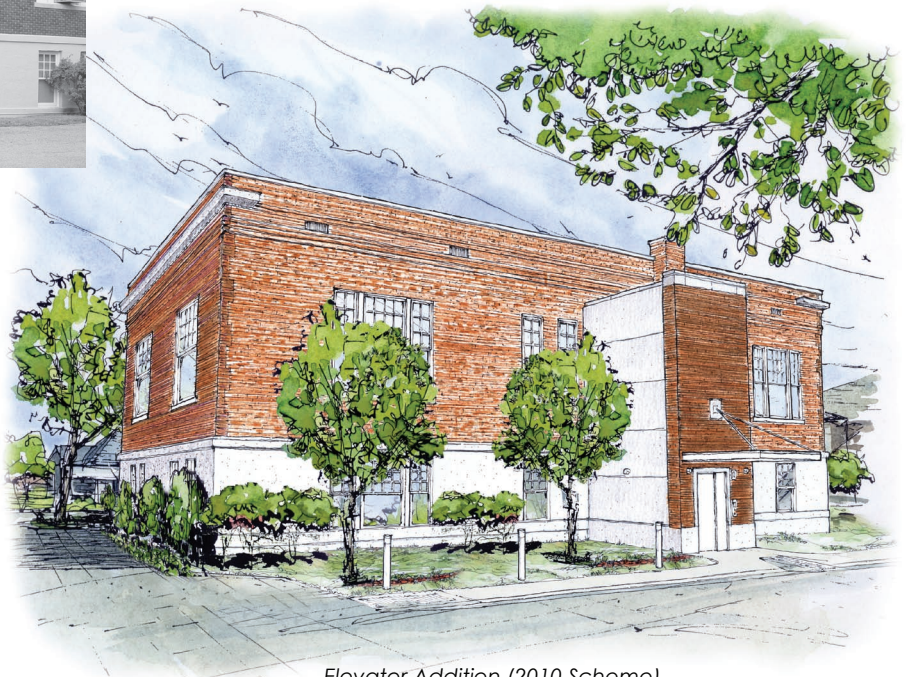
Elevator Addition (2010 Scheme)